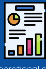
Operational and Regulatory Reporting