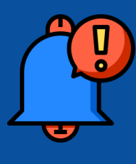
Notifications and Alerts