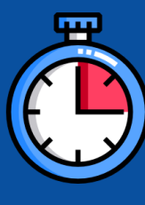
Service Level Agreements