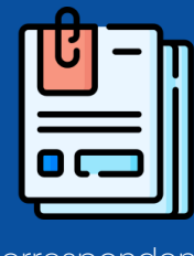
Correspondence and Fulfillment