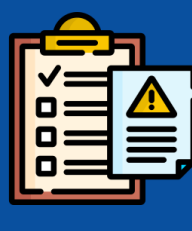
Business Rules and Data Validation